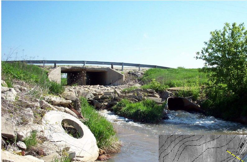
Rob Roy Creek at Jericho Road

Rob Roy Creek Kane and Kendall Counties, Illinois