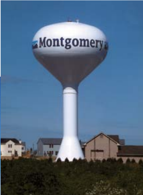
2 MG Elevated Water Storage Tank

Engineering Enterprises, Inc. (EEI) provided the planning, design and construction engineering services for Well No. 14 and Well No. 14 Water Treatment Plant and Elevated Water Storage Tank in the Village of Montgomery.