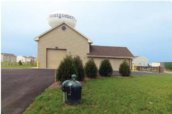
Well No. 14, Well No. 14 Water Treatment Plant