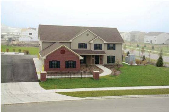
Well No. 14 Water Treatment Plant

Located in a residential neighborhood, the water treatment plant was architecturally designed to blend into the neighborhood and protect the level of investment that homeowners have made. For this project, EEI was presented with the American Council of Engineering Companies (ACEC) of Illinois 2005 Engineering Excellence Merit Award.